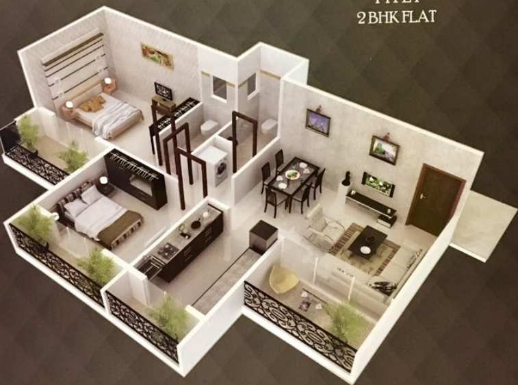
TYPE 1 2 BHK FLAT